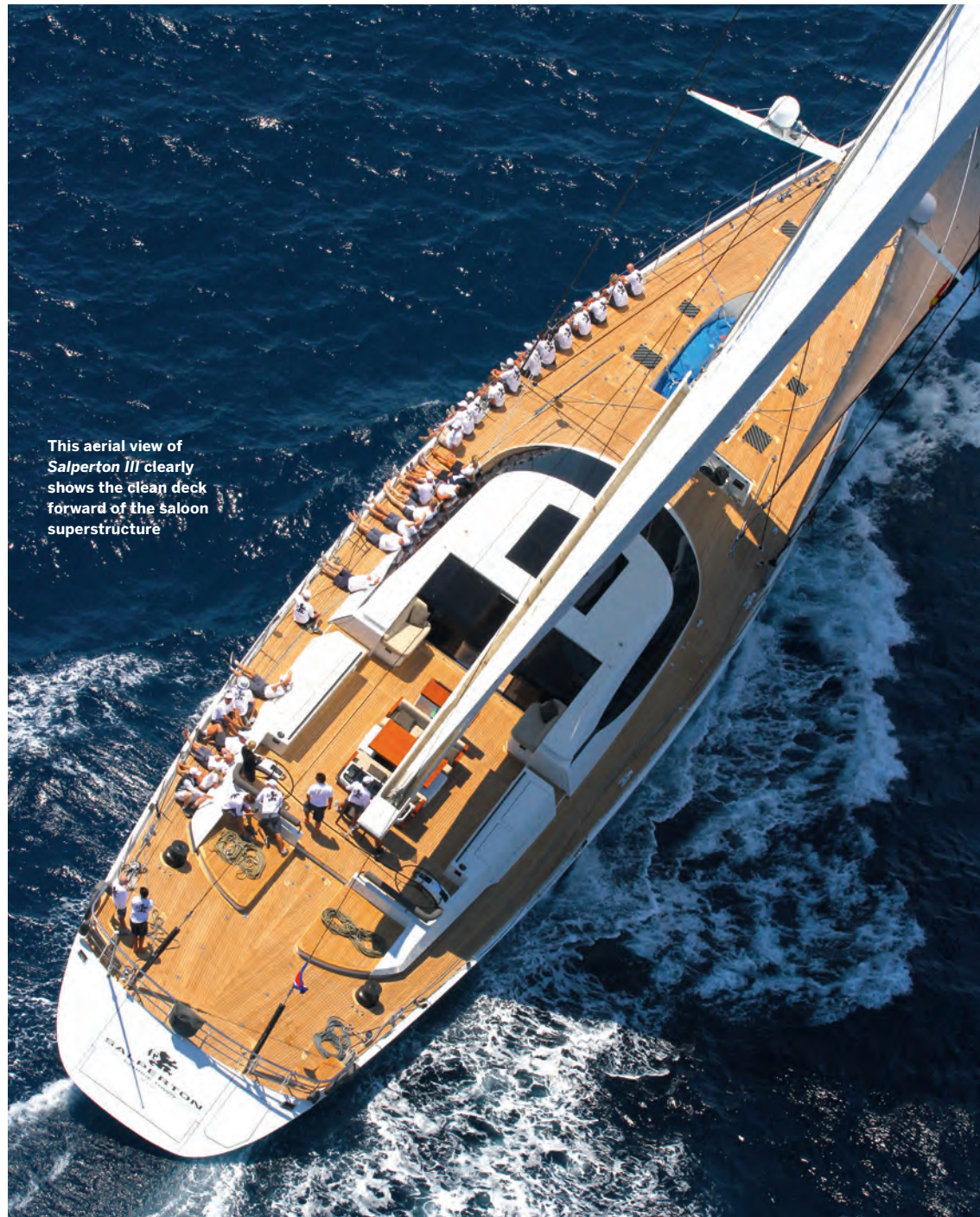
This aerial view of Salperton III clearly shows the clean deck forward of the saloon superstructure