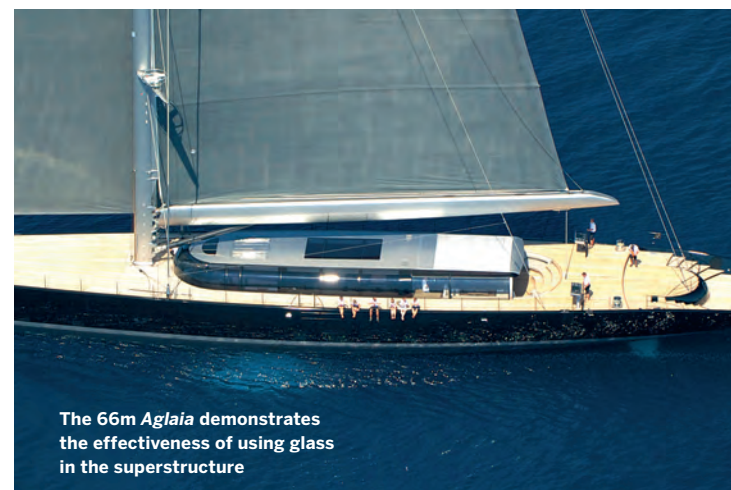
The 66m Aglaia demonstrates the effectiveness of using glass in the superstructure

streamline design. A photograph of her adorns an entire wall of his office in Lymington, McKeon selecting her as a stand-out yacht among the many he designed at DNA. The yacht's almost semi-circular superstructure windows allow occupants of the deck saloon to enjoy the seascape to port or starboard even with the yacht heeled hard.