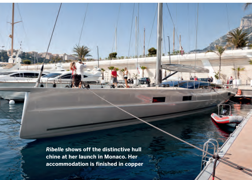
Ribelle shows off the distinctive hull chine at her launch in Monaco. Her accommodation is finished in copper

Ribelle's most striking feature, apart from the de rigeur glass deck saloon canopy, is a chine running the entire length of the topsides